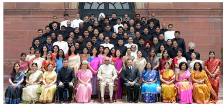
The President, Shri Ram Nath Kovind with the State Civil Service Officers promoted to the IAS and attending the 120th Induction Training Programme at the Lal Bahadur Shastri National Academy of Administration, Mussoorie, at Rashtrapati Bhavan, in New Delhi.

It is a serious hazard to good health. WHO everywhere mark the importance the health risks connected with tobacco use and advocating for effective policies to reduce tobacco use.