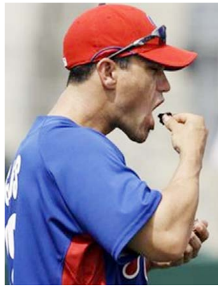
Irrespective of cultures and countries, backgrounds and ethnicities, tobacco is chewed in different forms and

ways. Tobacco use is the single most avoidable cause of death worldwide and is currently responsible for killing one in 10 adults worldwide. In India, at least 800,000 deaths every year are related to tobacco use, out of which 700,000 are related to smoking. Chewing tobacco reduces the lunges to a sponge that soaks in at least 30 known carcinogens, or cancer causing chemicals. The list of tobacco